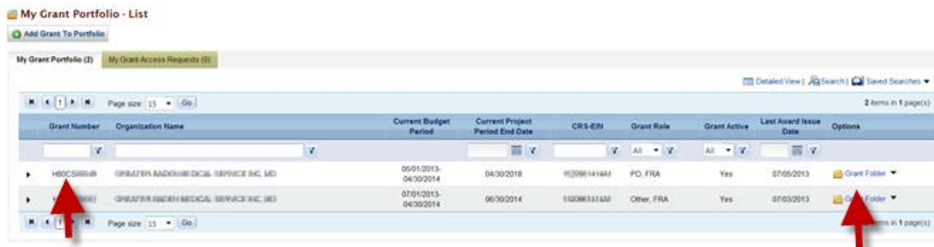
Figure 2: My Grant Portfolio – List Page