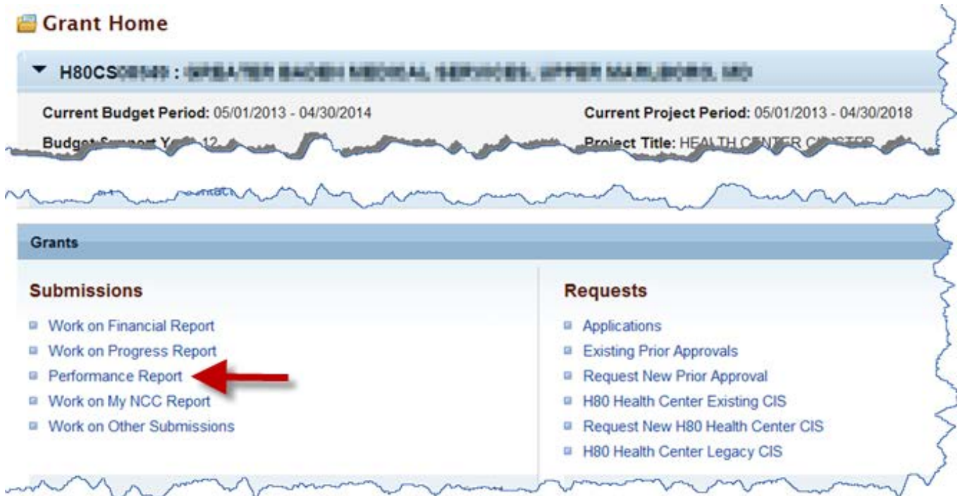
Figure 3: Grant Home Page