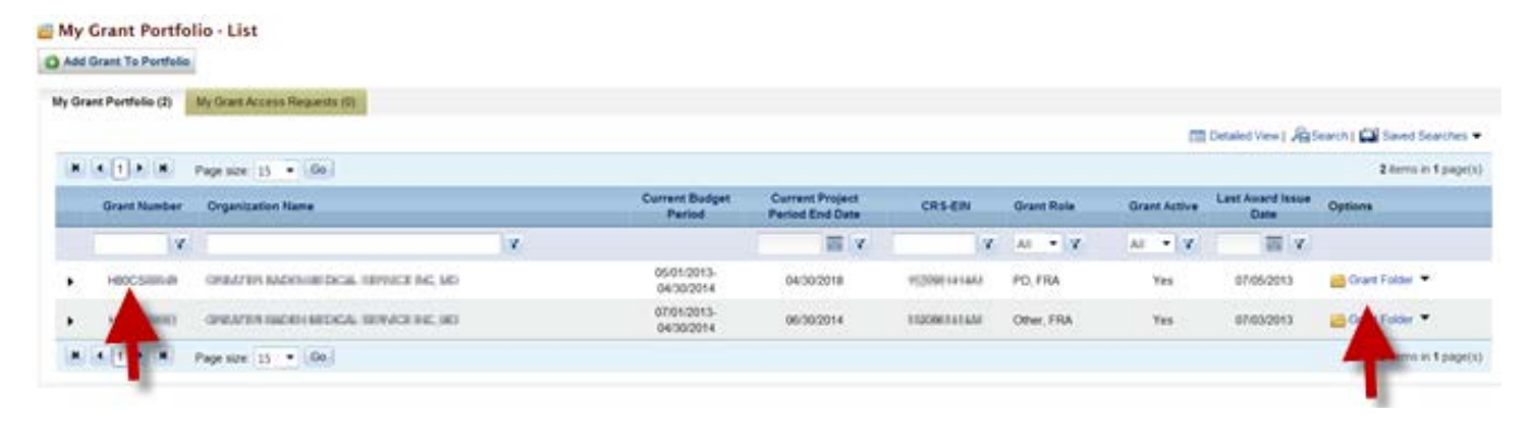
Figure 2: My Grant Portfolio - List Page

4. The Grant folder opens to the Grant Home page (Figure 3). In the Grants section of the page, under Submissions, click Performance Report .