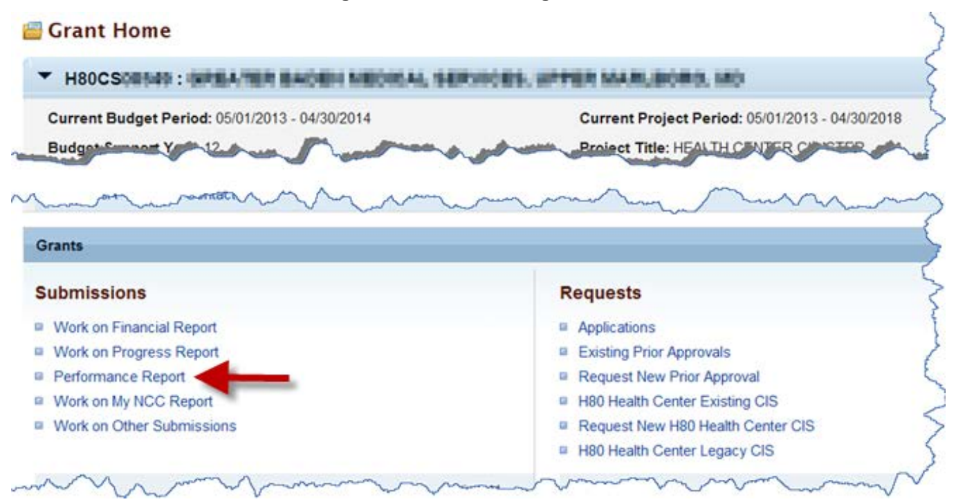
Figure 3: Grant Home Page

5. The Submissions – All page opens, displaying all performance reports related to the grant (Figure 4). To display only UDS reports, you can enter search parameters under Search Filters at the top of the page. For example, you can enter "UDS" in the Submission Name Like field, and then click Search .