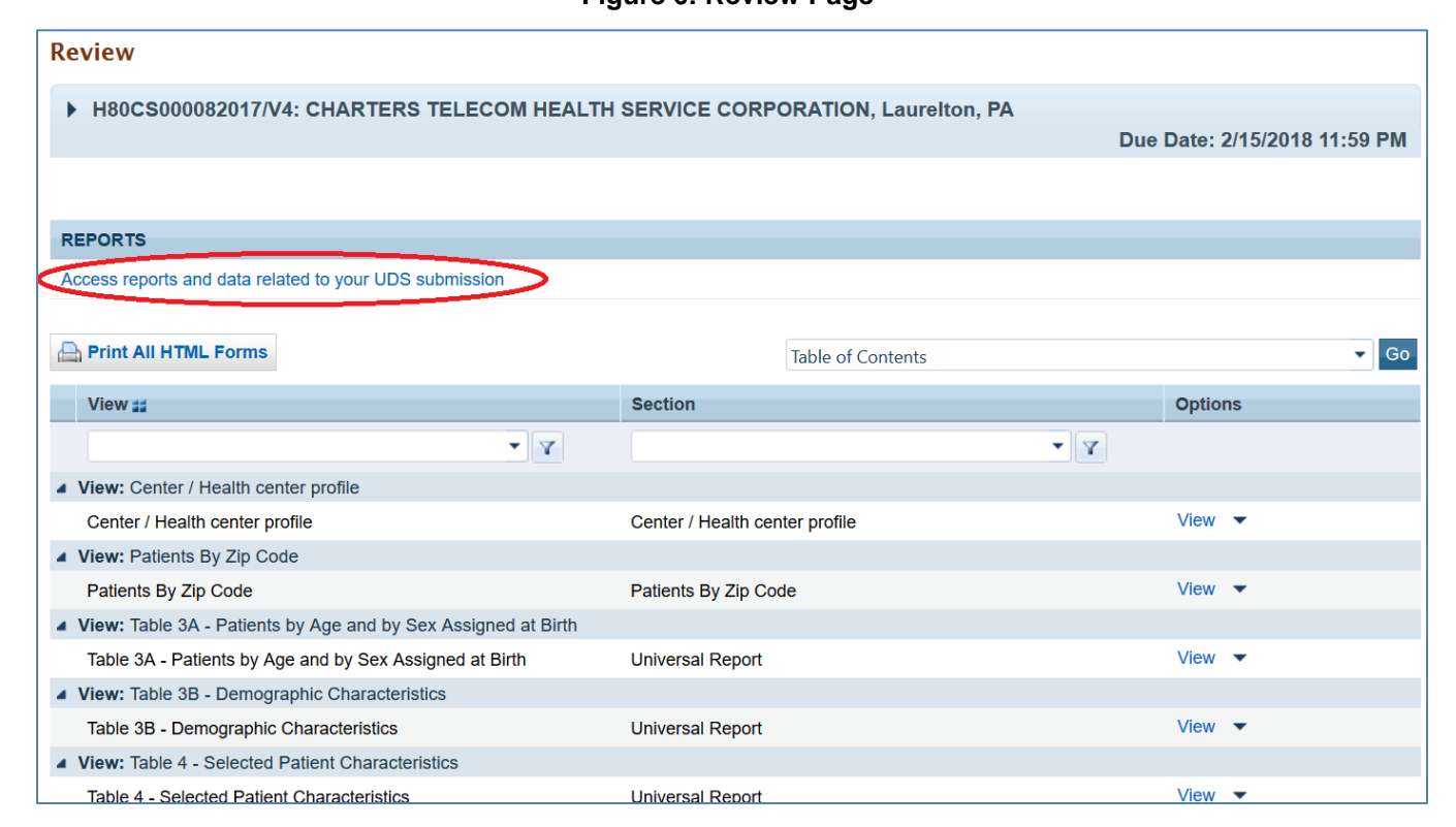
Figure 6: Review Page